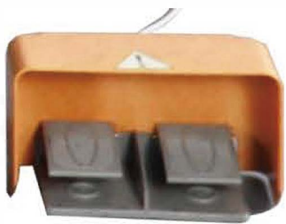
Foot control pedal controls the lift and down of table top.